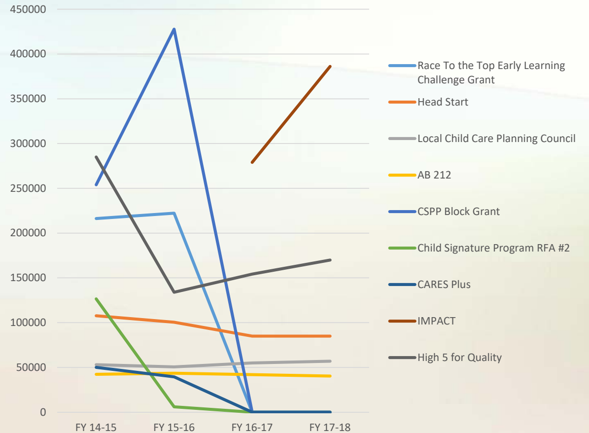
Quality Improvement Funding, El Dorado County, FY 2014-17

Funding for Early Care and Education adjusts with the Economy.